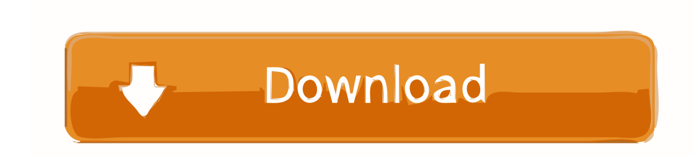
Photo To Sketch Pro 4.0 Crack, Keygen Plus Serial [ Number Or Key ]